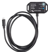
VE.Direct Bluetooth Smart Dongle