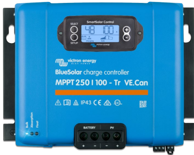
BlueSolar Charge Controller MPPT 250/100-Tr VE.Can with optional display